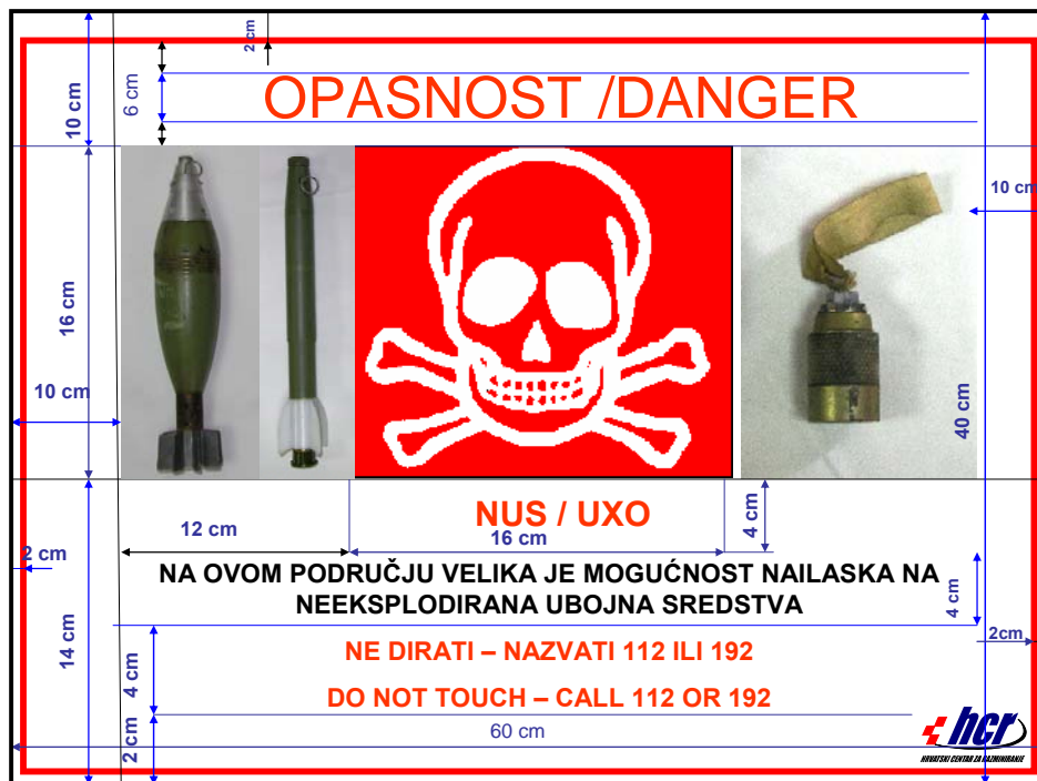
Figure 2: Dimensions and positions of text and pictures on the sign